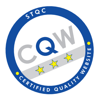
Assured Quality of Service Website Quality Level III